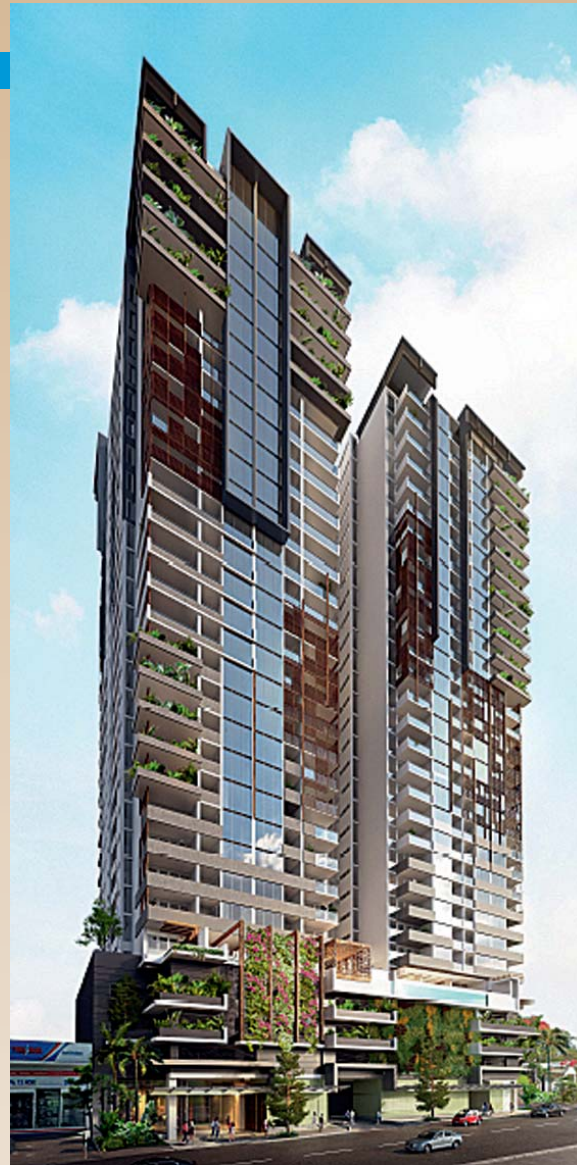
Work started on Ivy last October with twin towers due to soar over South Brisbane by 2018.