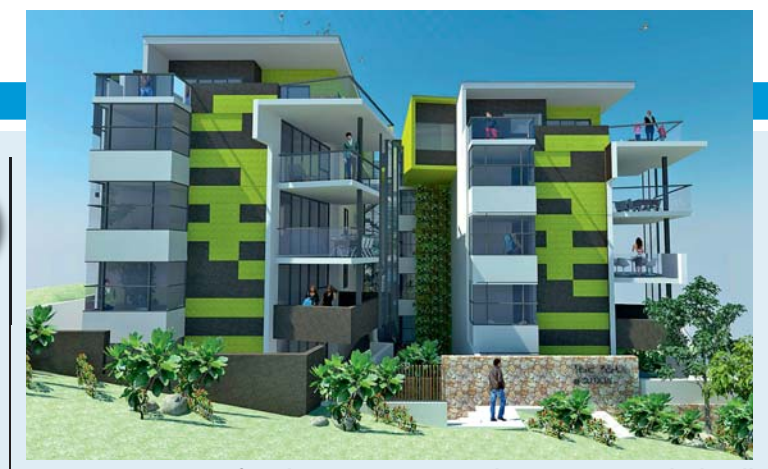
Artist's impression of Peak Apartments in Brisbane's St Lucia which will consist of three separate five-storey buildings.