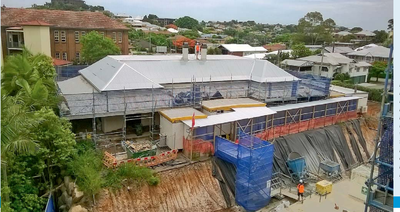
LEFT: Highland House is a heritage refurbishment underway within the Aveo retirement community in Clayfield, Brisbane.