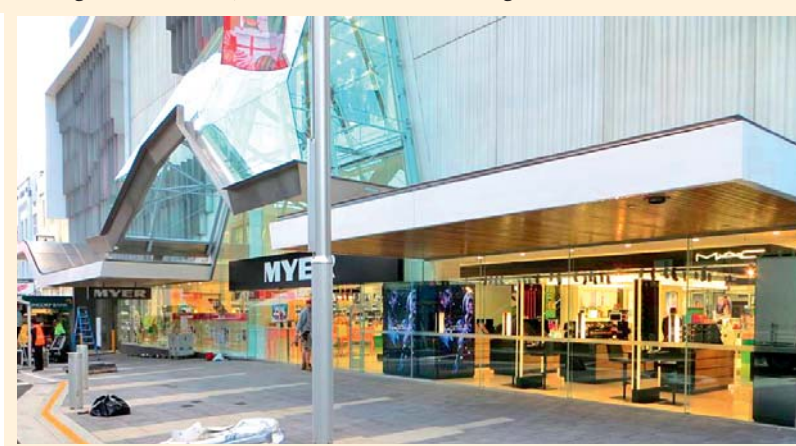
Hobart's new five-level Myer store was open in time for Christmas.