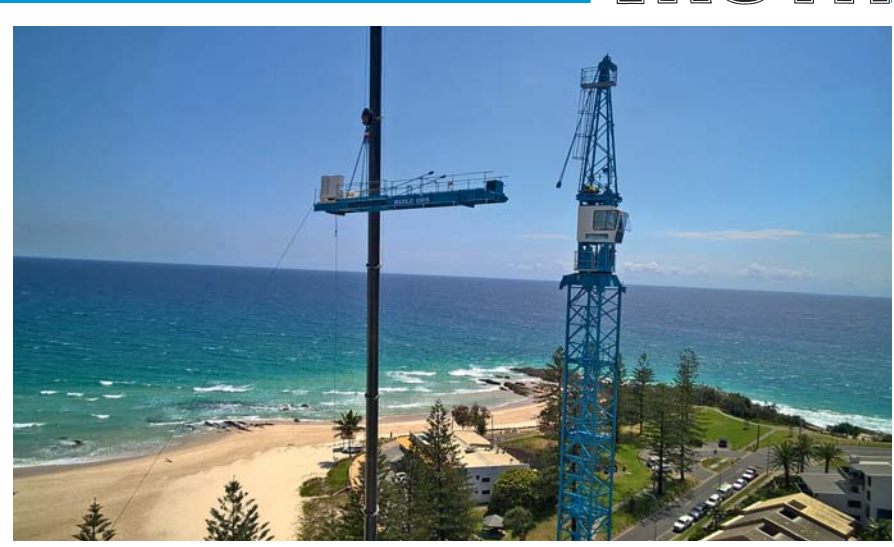
View of the famous Snapper Rocks surf break from The Garland on Rainbow Bay now under construction.

Picture us on Instagram : hutchies1912 See our company page on LinkedIn : http://www.linkedin.com/company/91031?trk=pro_other_cmpy